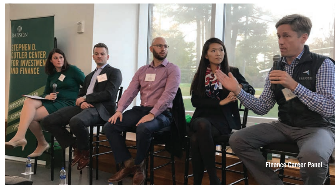
Finance Career Panel